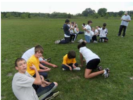
We offer physical education activities