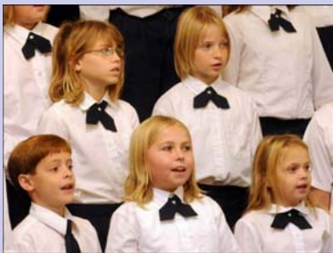
Veterans Day at BCCA

Our students are happier, more focused and better able to choose the right path in an increasingly confused world. Proficient in computers and technology, our graduates carry with them the special gift of Biblical learning and love for God and His son Jesus Christ, much like our Founding Fathers received.